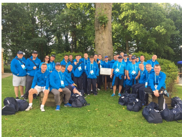
FOOTBALL 3 teams