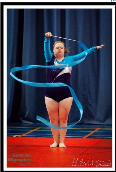
GYMNASTICS – Artistic and Rhythmic