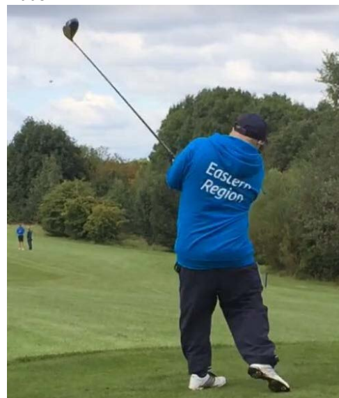
Eastern Region Golf in action

The Eastern Golf Team of six players brought home 1 gold, 1 silver, 2 bronze, one 4 th and one 5 th place ribbon.