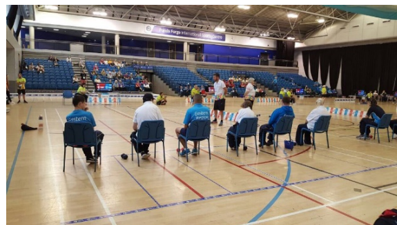
Eastern Boccia Team in action