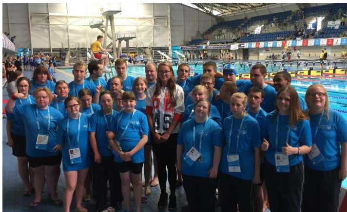
AQUATICS with Paralympic Champion Jessica-Jane Applegate MBE