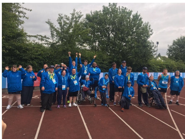
ATHLETICS (this group photo just Norfolk athletes)